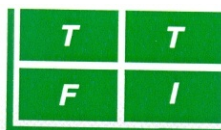
TABLE TENNIS FEDERATION OF INDIA